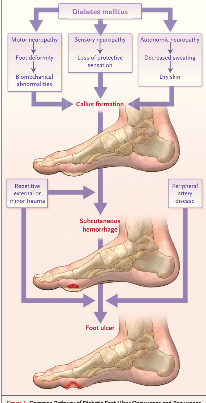
Figure 1. Common Pathway of Diabetic Foot Ulcer Occurrence and Recurrence. Diabetic foot ulcers and their recurrences are caused by a number of factors that ultimately lead to skin breakdown. These factors include sequelae related to sensory, autonomic, and motor neuropathies.

failure, renal disease, depression, and most forms of cancer. Data from England suggest that during the 2010–2011 period, just under 10% of